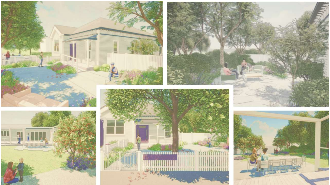
Meadows Landscaping Proposal

The outdoor and home improvement project is underway, with generous funding received from Rātā Foundation, Lottery Community, NCC, and TDC.